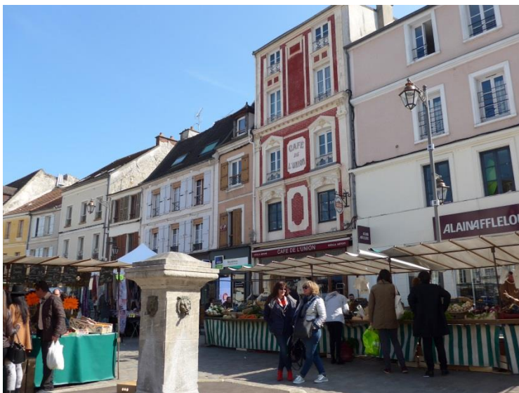
Place du Marché

Choose a Wednesday or a Sunday in spring, summer or autumn, when there is a market and the Commanderie is open. Mild sunny weather is preferable for the walk.