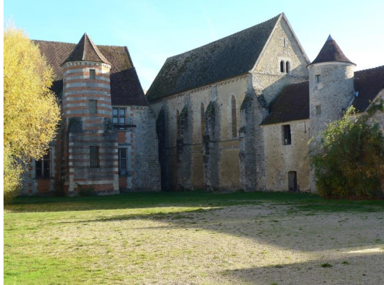
The Commanderie des Templiers

Discover the mysterious, violent history of the Templars, as well as the charm of a provincial market town